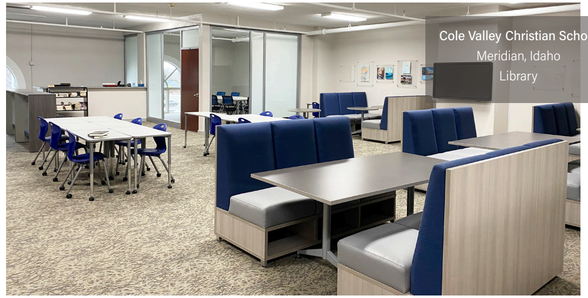
Cole Valley Christian School Meridian, Idaho Library