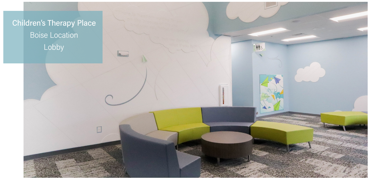
Children's Therapy Place Boise Location Lobby