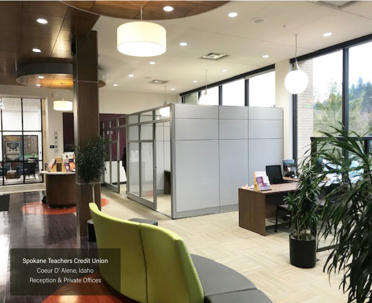
Spokane Teachers Credit Union Coeur D' Alene, Idaho Reception & Private Offices