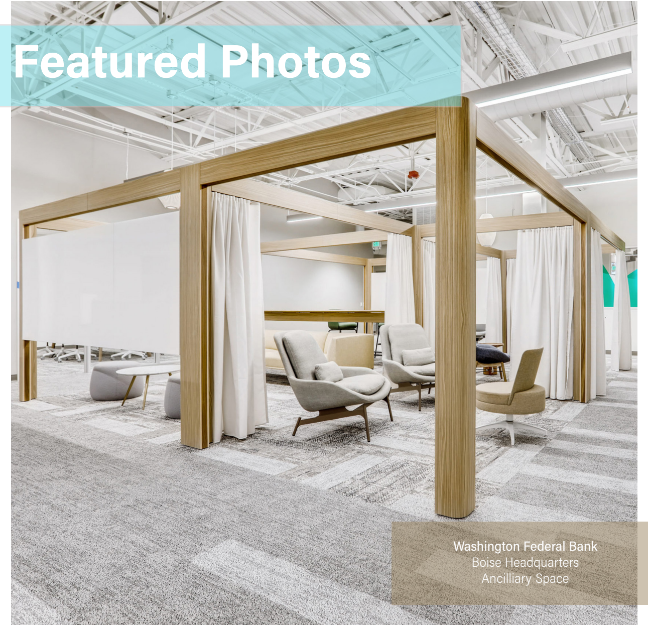
Washington Federal Bank Boise Headquarters Ancillary Space