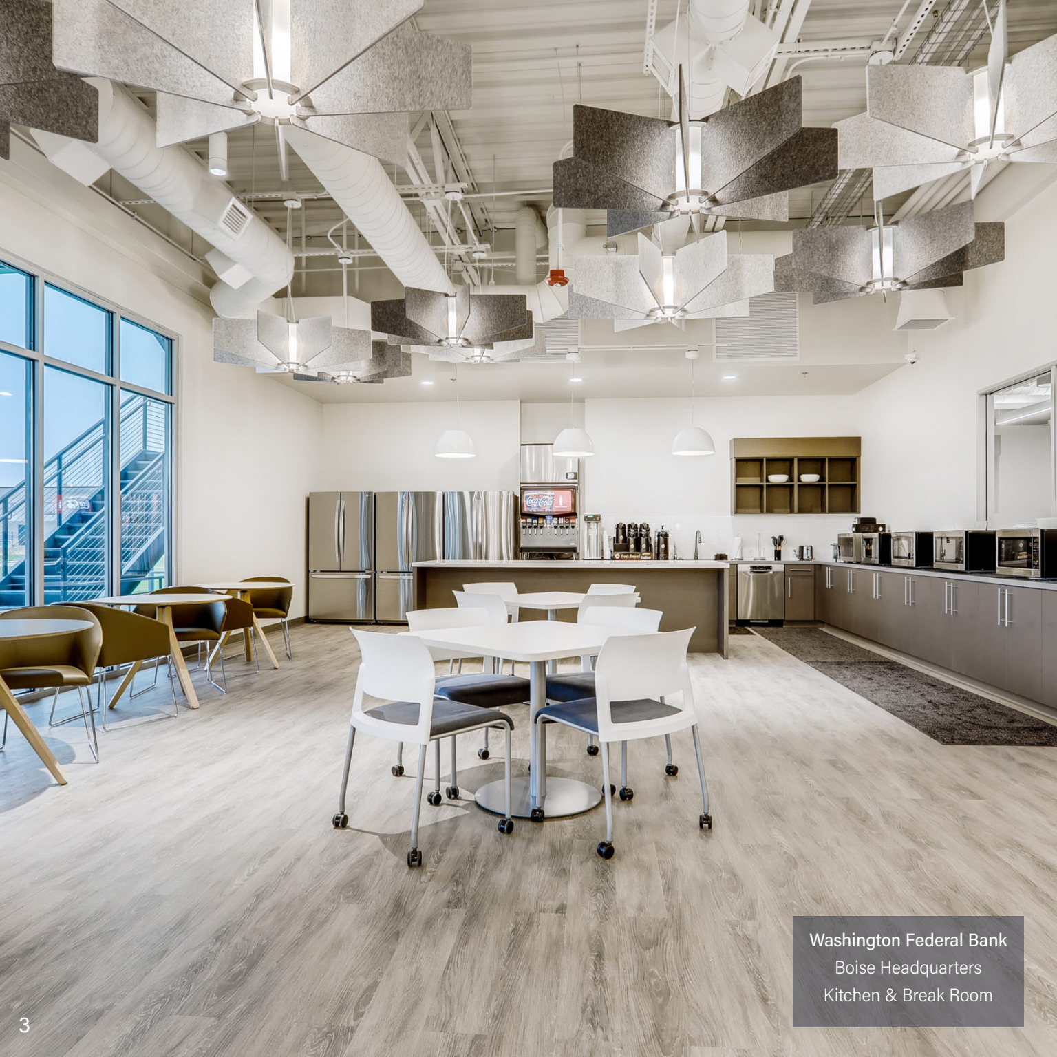
Washington Federal Bank Boise Headquarters Kitchen & Break Room