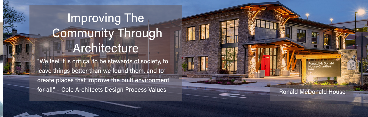
Ronald McDonald House

"We feel it is critical to be stewards of society, to leave things better than we found them, and to create places that improve the built environment for all." - Cole Architects Design Process Values