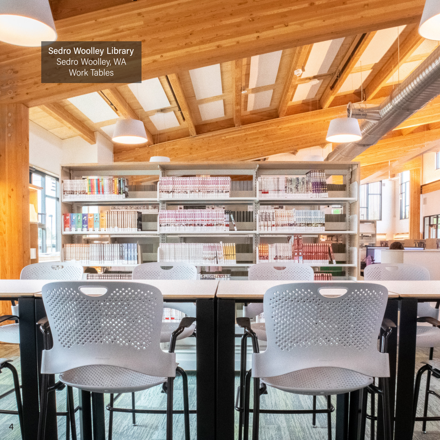
Sedro Woolley Library Sedro Woolley, WA Work Tables