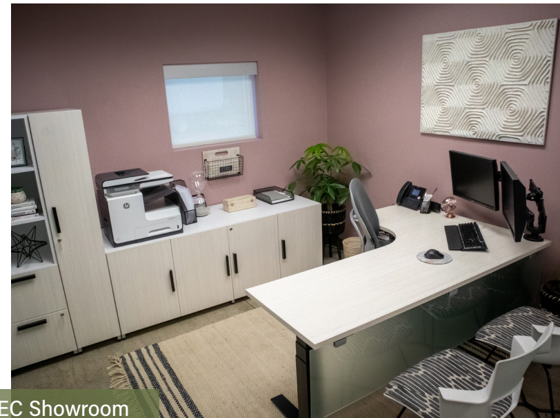
OEC Showroom Boise Headquarters The Pink Office