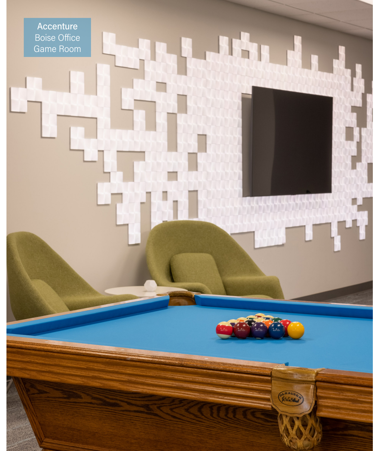
Accenture Boise Office Game Room