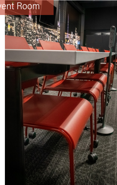
Pursuit of Profit Meridian, Idaho Event Room