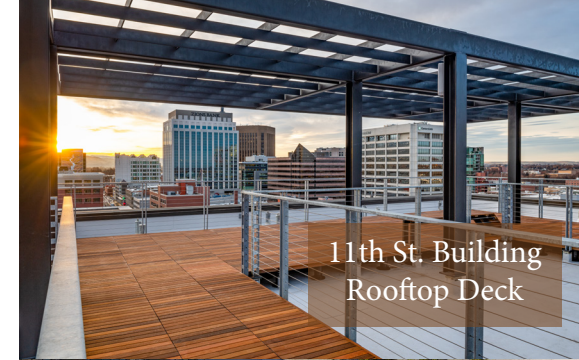
11th St. Building Rooftop Deck

Through its quality construction, exceptional management, and community focus, it is no wonder Rafanelli & Nahas have been so successful in Boise. But at the heart of the firm is a deep-rooted love and even stewardship for Boise and its culture. It is not often that you encounter a developer that takes on the responsibility to up the game on architecture in a city. While many firms are willing to forfeit quality to get something built, Rafanelli & Nahas is fighting against that. They hope that design review, CCDC, and planning and zoning will look to buildings like theirs and ask, "Why would we allow anything less to be built in our downtown?" oec