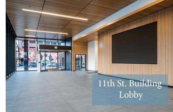
11th St. Building Lobby