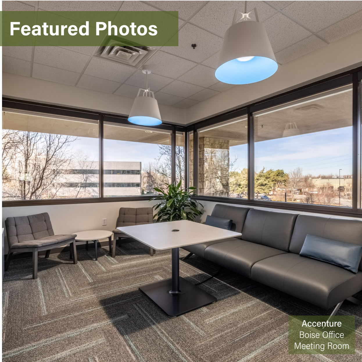
Accenture Boise Office Meeting Room