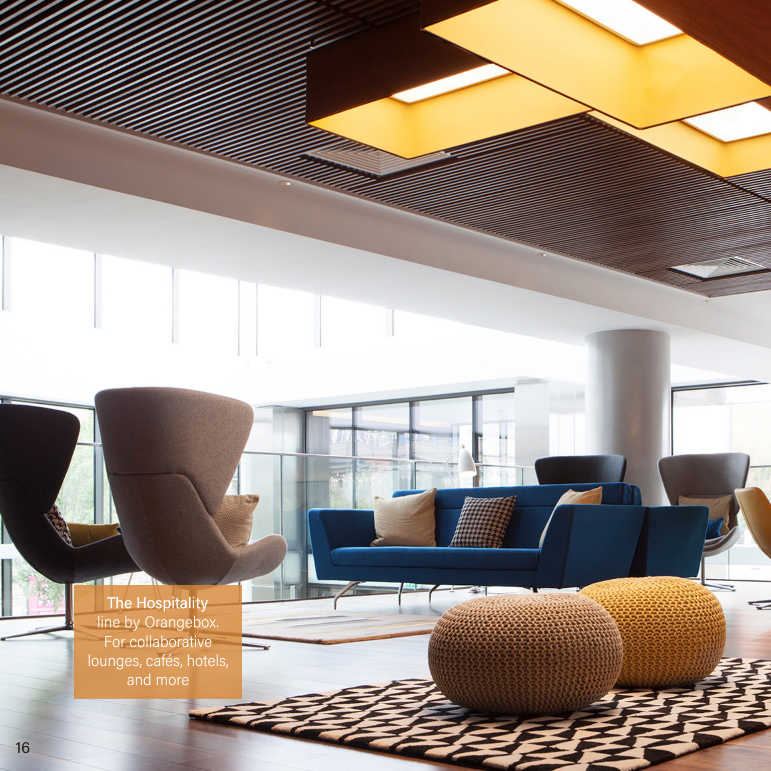
The Hospitality line by Orangebox. For collaborative lounges, cafés, hotels, and more