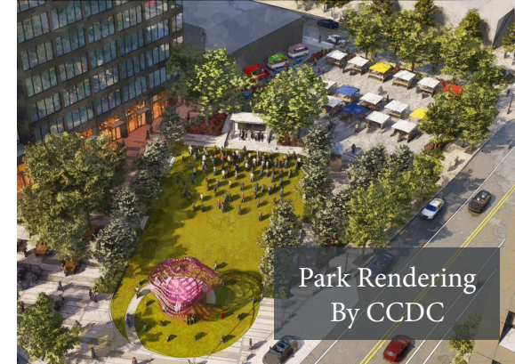
Park Rendering By CCDC