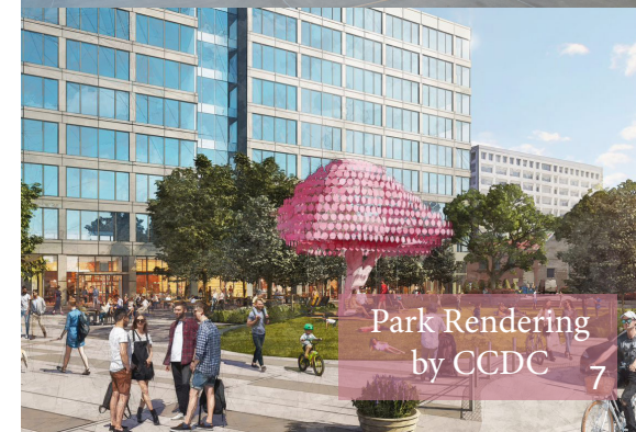
Park Rendering by CCDC