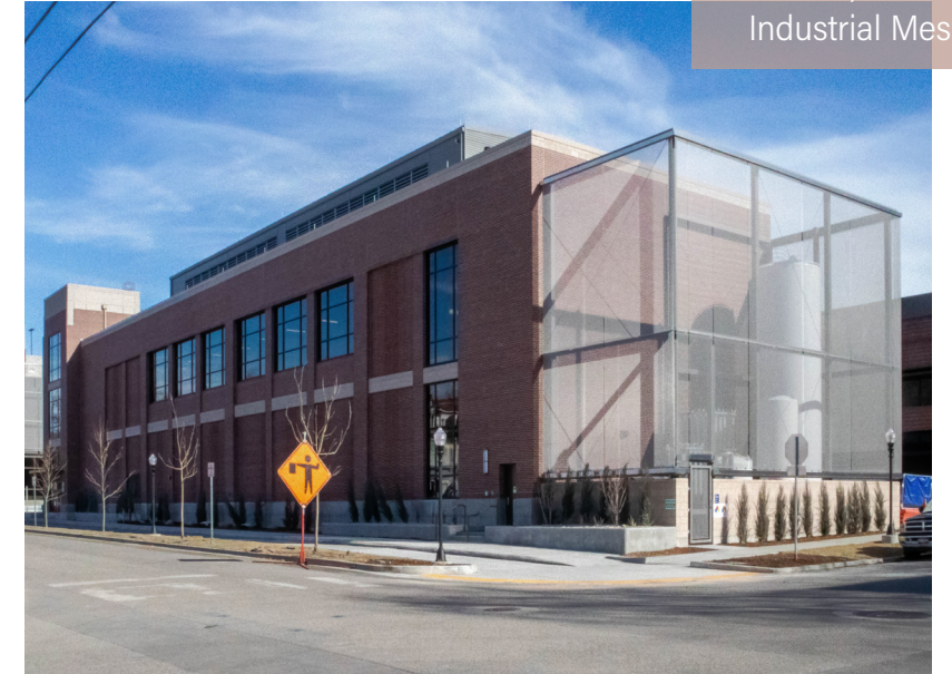
St. Luke's Hospital Boise, Idaho Industrial Mesh