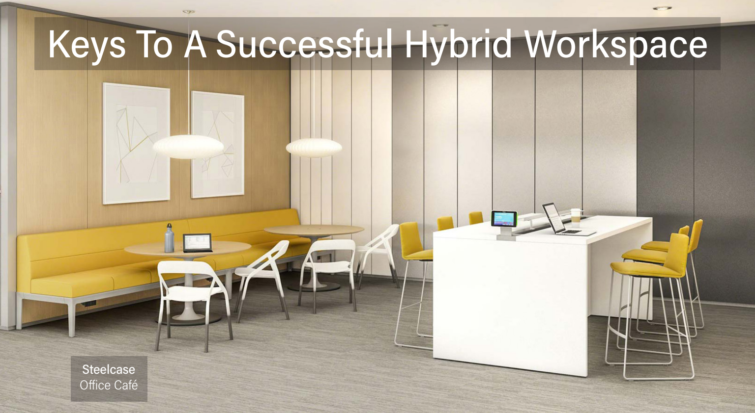
Steelcase Office Café

Many people can't wait to return to the office and work side-by-side with their colleagues again and organizations are taking every precaution to make sure workplaces are safe when people do come back. But what if these precautionary measures make the office feel sad and even more isolating than working from home? Below are a few things organizations should consider when introducing a hybrid work style to their offices.