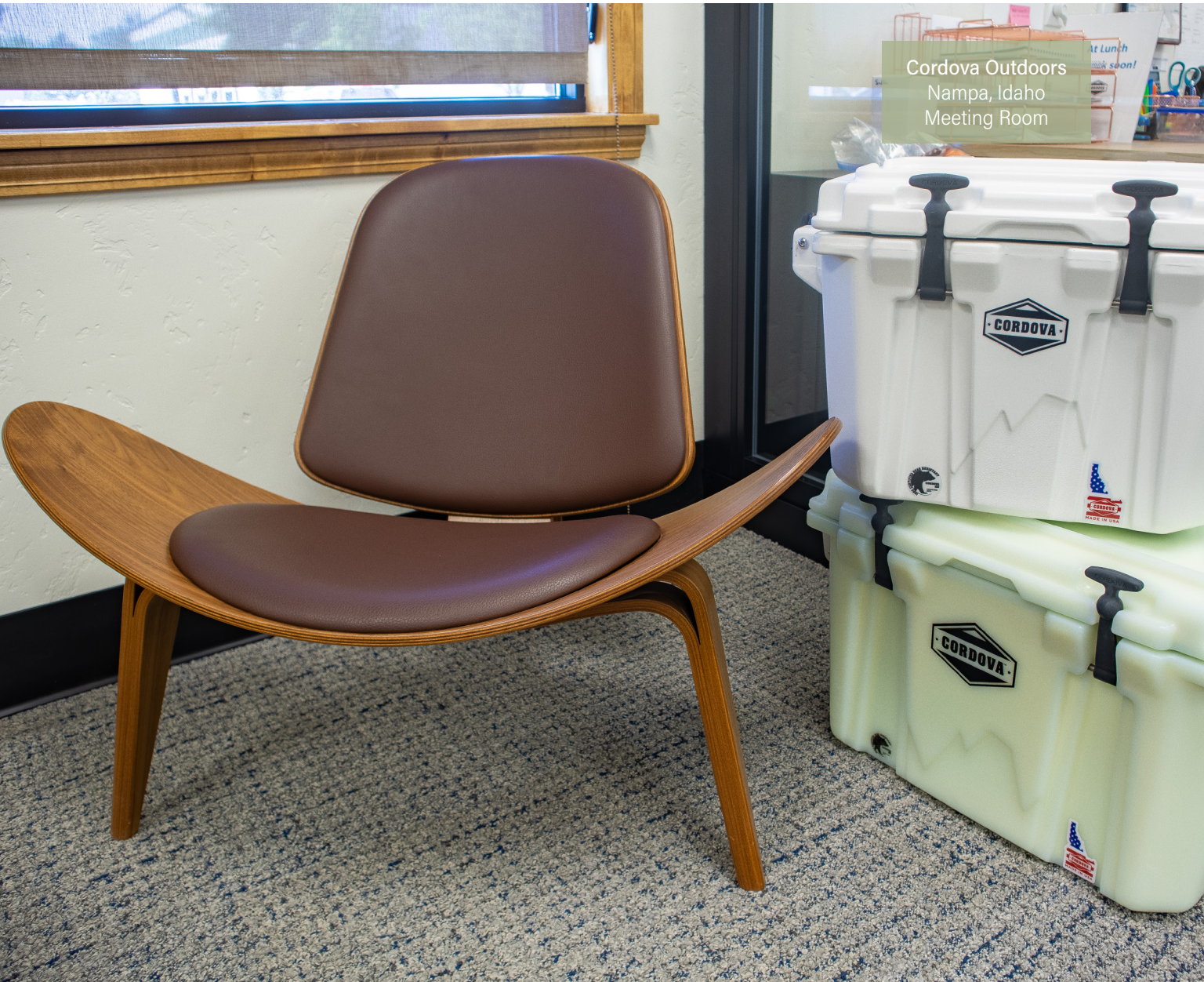
Cordova Outdoors Nampa, Idaho Meeting Room