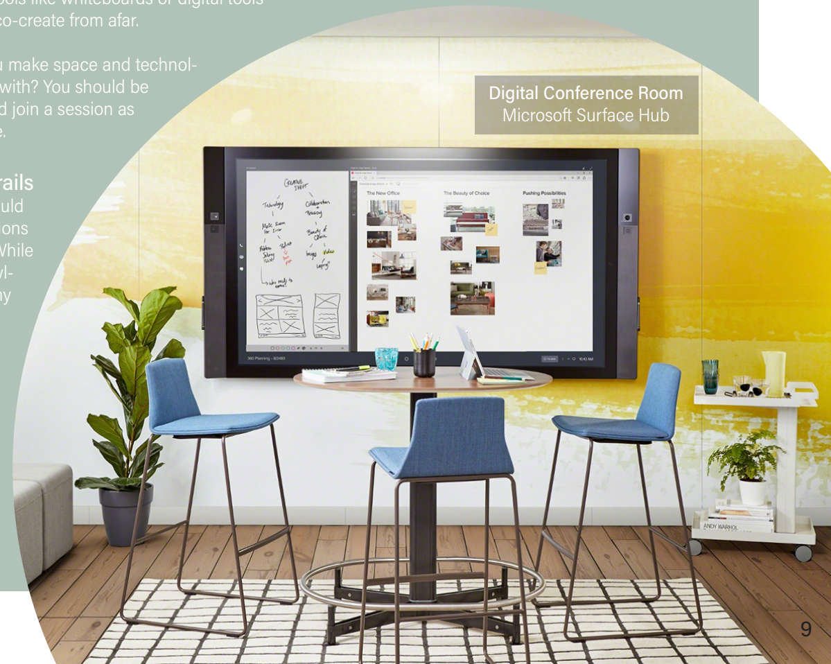
Digital Conference Room Microsoft Surface Hub

Culture, innovation and growth are exactly the things leaders globally are worried about. That's why contrary to what we read a year ago about the office going away, the opposite has actually happened. Whether or not our future workplace is bigger, the same size or smaller, or is made up of an ecosystem that includes home, the places where we come together matter more now than they ever did because we have a year to make up for. oec