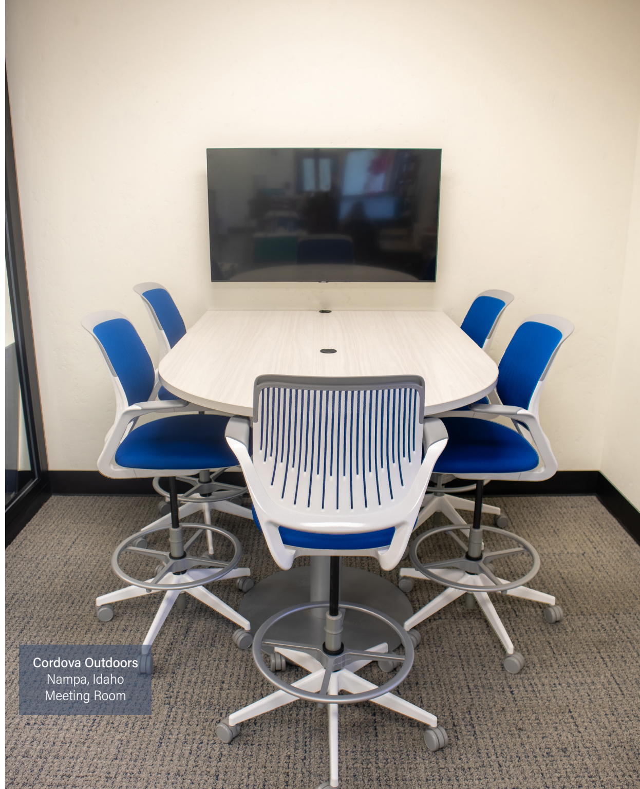
Cordova Outdoors Nampa, Idaho Meeting Room