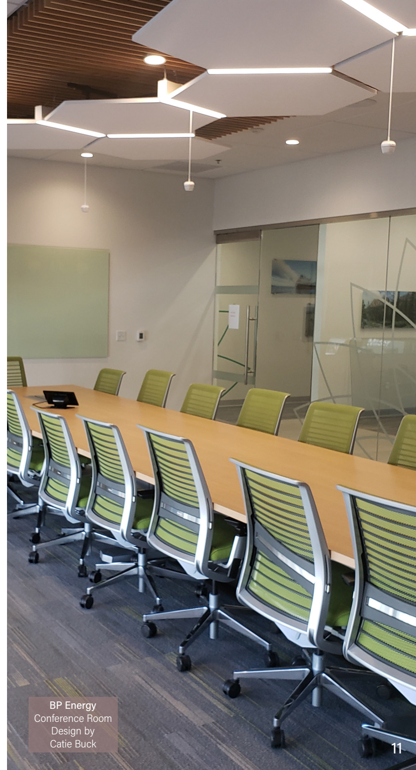
BP Energy Conference Room Design by Catie Buck

These designers all have something in common. They are being invited to design in workplaces and homes like never before. People are beginning to realize that designers provide a holistic approach that fosters community and leaves them inspired. oec