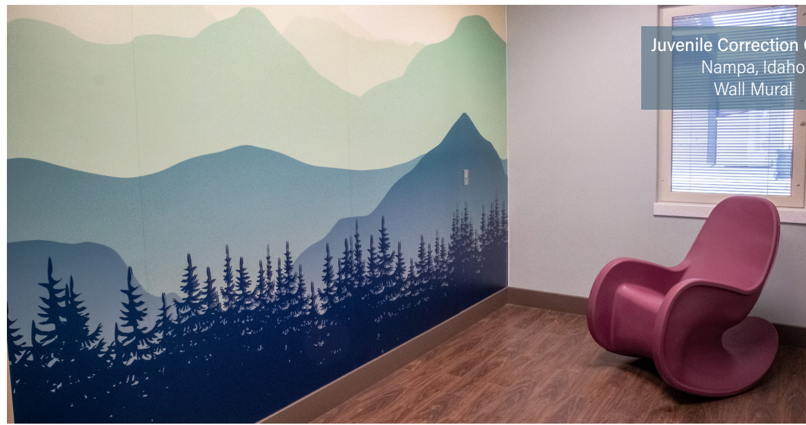
Juvenile Correction Center Nampa, Idaho Wall Mural