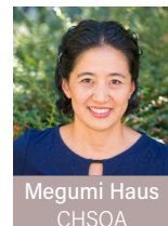
Megumi Haus CHSQA