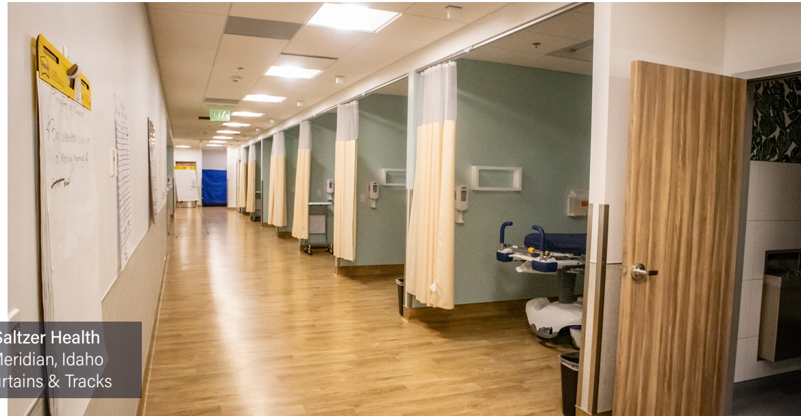
Saltzer Health Meridian, Idaho Curtains & Tracks