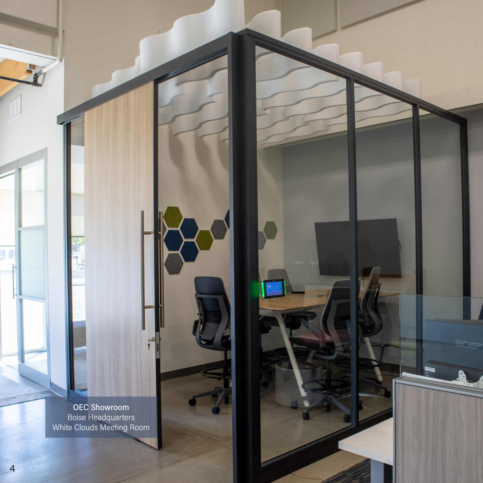
OEC Showroom Boise Headquarters White Clouds Meeting Room