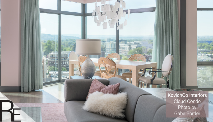
KovichCo Interiors Cloud Condo

Design creates culture. Culture shapes values. Values determine the future. - Robert L. Peters