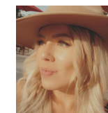
Catie Buck Babcock Design Group

For one of their recent projects in downtown Boise, they pulled inspiration from the surrounding foothills. "With the foothills in the background, we took this idea of home and incorporated the hill colors, which are pops of blues and indigo." One of the exciting ways the firm achieved a homey feel was by creating a wall of recycled leather belts. The belt wall is unique in that it immediately puts guests at ease. From there, creating the rest of that feel comes down to spatial layout. "If you design something well, it makes people want to go to that space. Giving them an opportunity to decide if they want to sit in a grouping of four where they can be social, or by themselves helps them feel like they are a part of something."